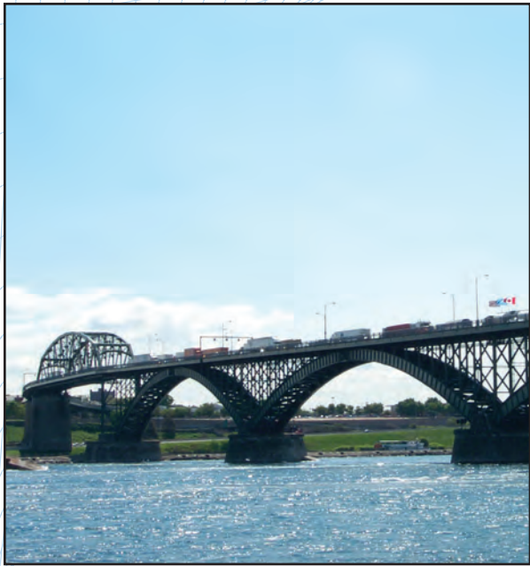
The Peace Bridge - Buffalo, New York

As a result of the Intelligence Reform and Terrorism Prevention Act of 2004, significant changes to our nation's border security were mandated. One of these changes, known as the Western Hemisphere Travel Initiative (WHTI), requires a passport or other federally-approved identification document for all travel into the United States.